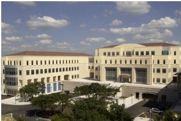
UTSA - Main Building