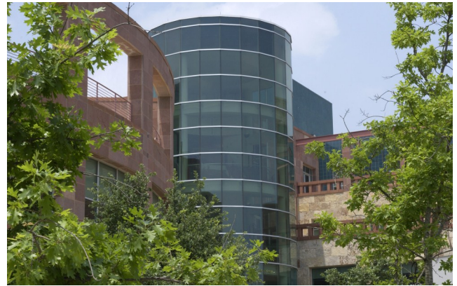
UTSA - Buena Vista Staircase