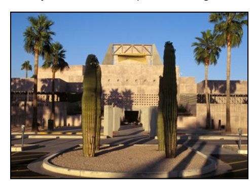
Arizona State University