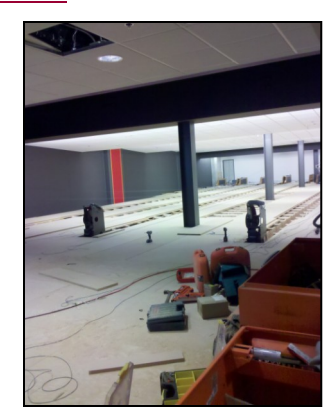
"Thunder Alley" bowling alley under construction at GCU