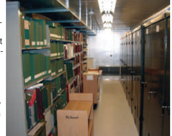
The original prefabricated room envelope that contains the papyrus collection, which consisted of metal skin walls with an excellent R-15 insulation value, was still in mint condition and didn't need updating during the indoor air quality retrofit.