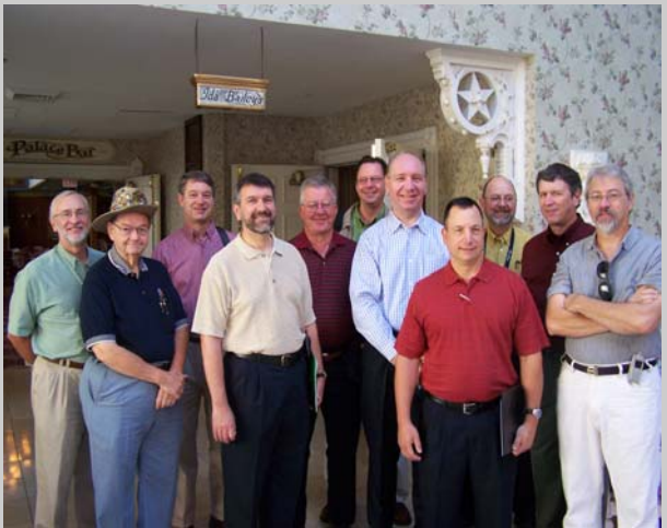
Horton Grand Hotel