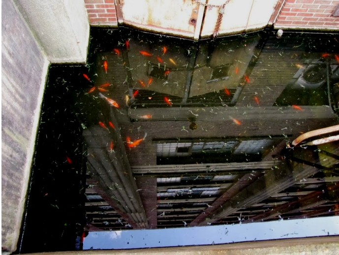
The Navy Yard- 624 building has a flooded basement. The flooded basement in this building is occupied by fish that appear to be goldfish.