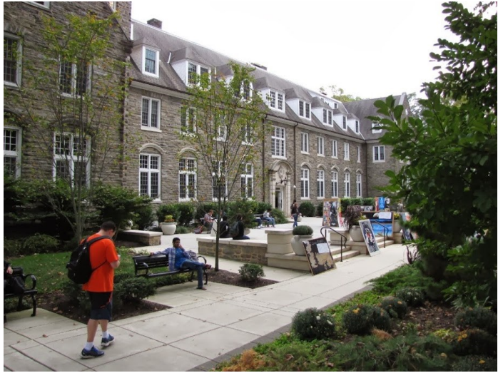
PSU Abington--Sutherland Bldg--a great outdoor space for many student activities and more formal receptions or other major events.