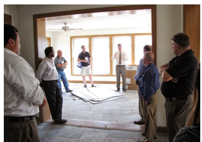
The Navy Yard-the net zero energy experimental house - AFC and IFMA tour attendees listening to the presentation.