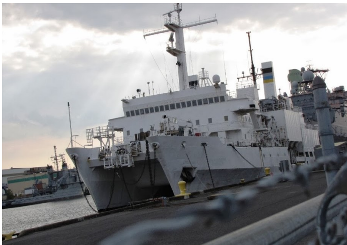
The Navy Yard - more of the many moth-balled ships, this one a catamaran design, in the fresh water port.