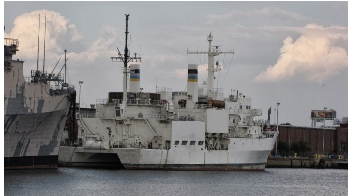
The Navy Yard - more of the many moth-balled ships, this one a catamaran design, in the fresh water port.