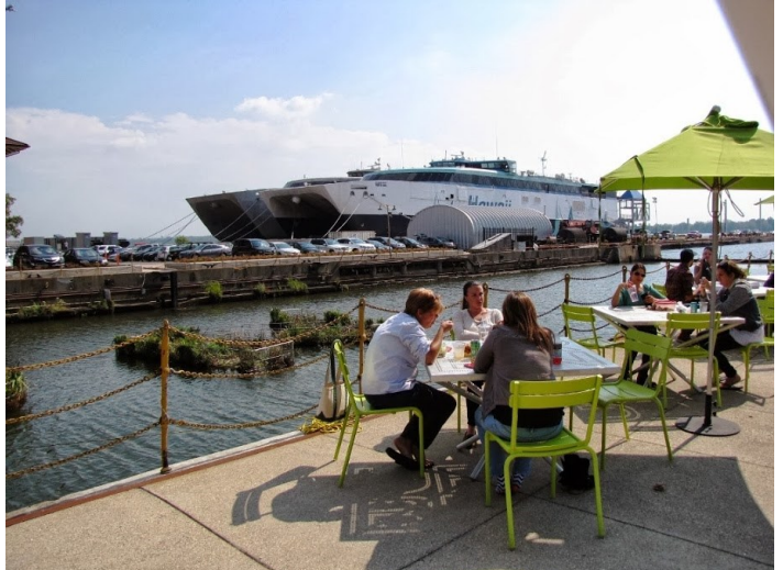
The Navy Yard-Bldg 543-Urban Outfitters - terrace outside their lunch room.