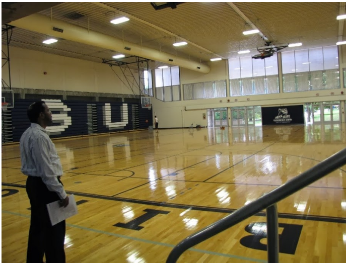
PSU Abington--the gym in the Athletics Building.