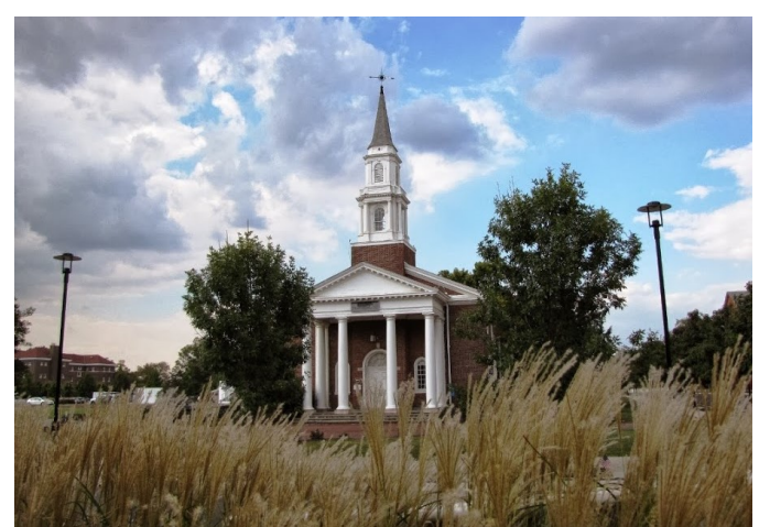
The Navy Yard--a multi-denominational chapel on site.