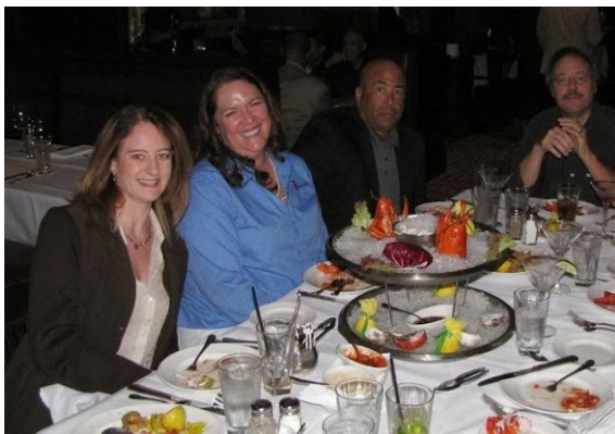
AFC President's Invitation Dinner at the City Grill in downtown Philly