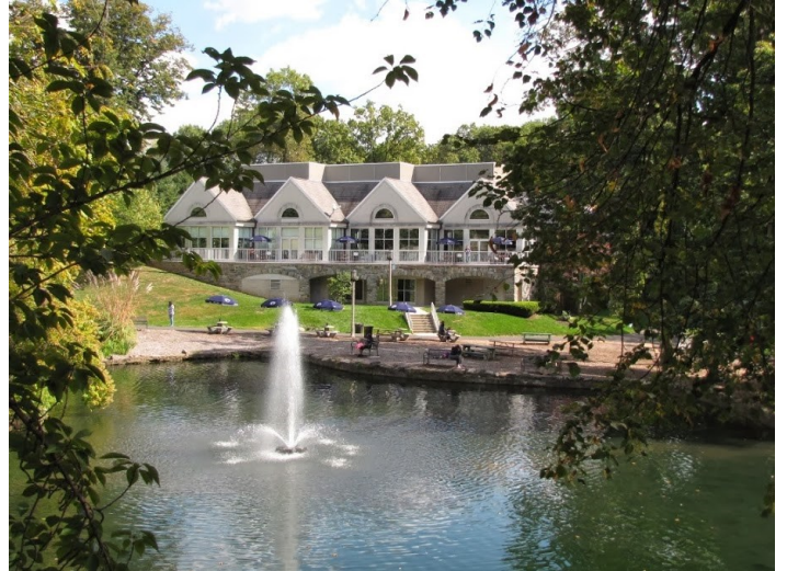
PSU Abington--Lares Building, pond and fountain as seen from the Woodland Building.