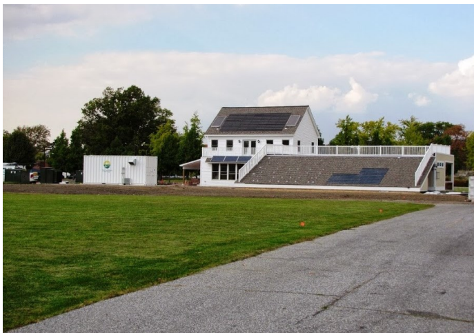
The Navy Yard-the net zero energy experimental house - and the separate experiment, research and work shop building.