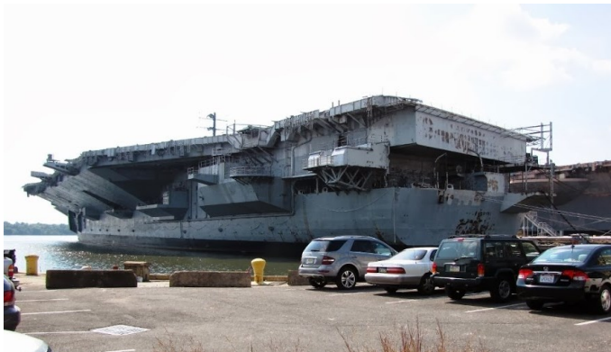
The Navy Yard-near Bldg 543-Urban Outfitters - one of the two moth-balled aircraft carriers.