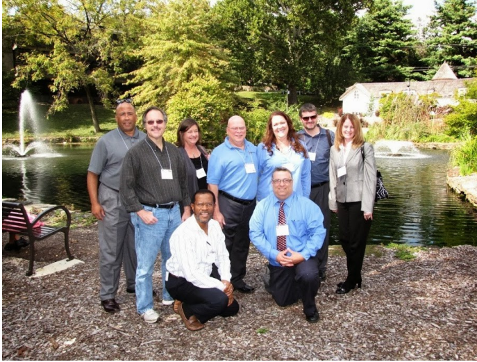
PSU Abington--the AFC attendees were delighted with the beauty of the pond and fountains and just had to have their group photo taken.