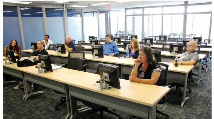
Villanova at The Navy Yard-their high tech classroom, with monitors per 2 student seats and no projection screens.