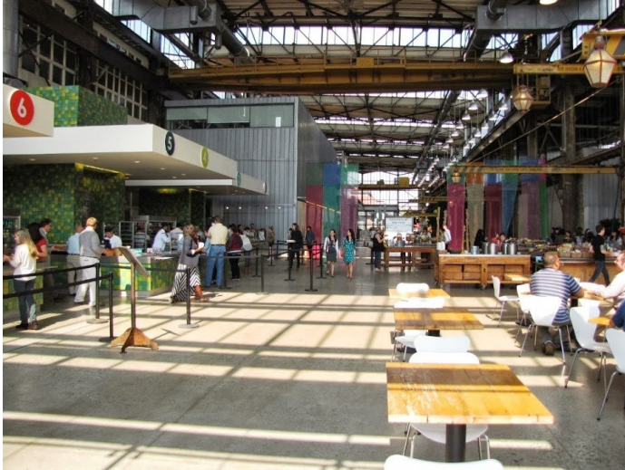
The Navy Yard-Bldg 543-Urban Outfitters - their cafeteria and lunch room.