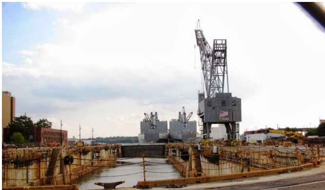
The Navy Yard - a dry dock with gantry crane and some moth-balled ships in the distance.