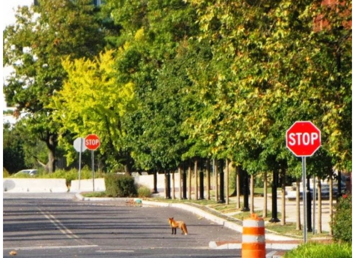
The Navy Yard--there are some very special occupants on site, such as this fox seen a few blocks from where we were standing while on tour.