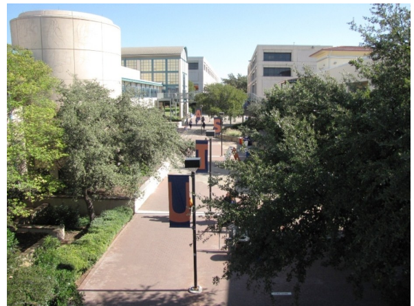
University of Texas in San Antonio