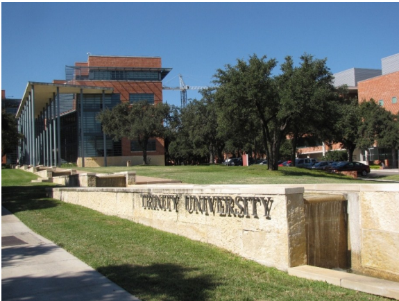
Trinity University, San Antonio Texas

When I read accounts of gatherings such as this, I read between the lines and think, "those people all know each other and they're a clique. Why would I go join them? I'd probably be isolated and feel alone the whole time." The truth is, every person who attends an AFC conference/meeting is warmly welcomed by all. Learning from each other is the greatest amenity the AFC offers. I haven't met an AFC member yet who didn't have a sense of humor and I can't tell you how much I look forward to gathering twice a year with such a knowledgeable, passionate, professional and goofy bunch of oddballs. The next time you see an opportunity to attend Facility Fusion, the Spring Conference (in San Diego next June) or the Fall Conference (just prior to World Workplace) – put it on your calendar and request funding. You will NOT regret it.