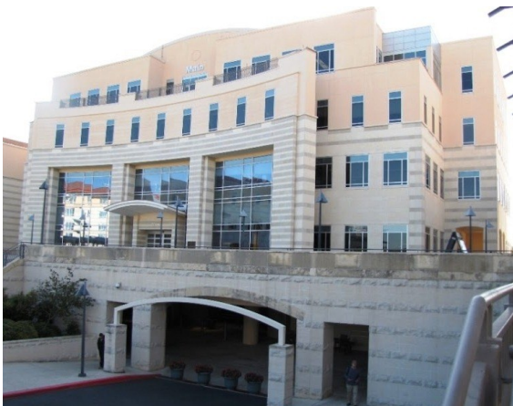
University of Texas in San Antonio