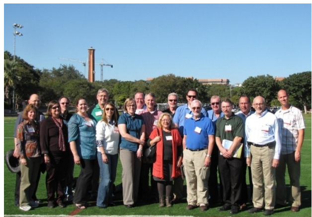
AFC Group @ Trinity University, San Antonio Texas