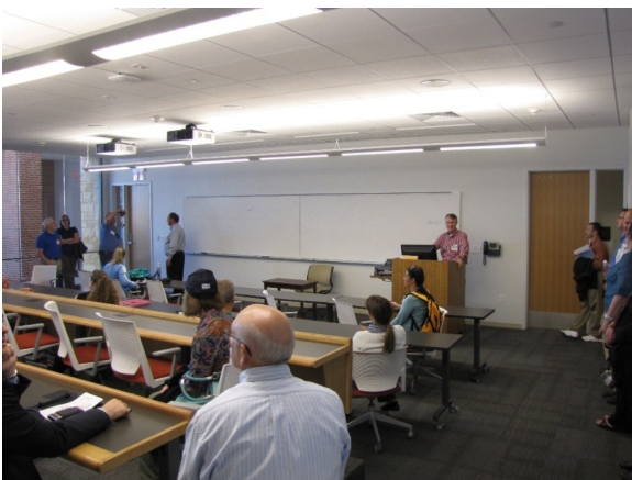
Classroom @ Trinity University, San Antonio Texas