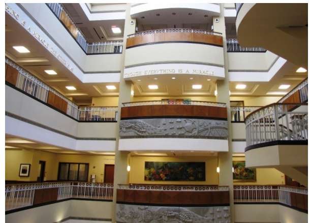
University of Texas in San Antonio