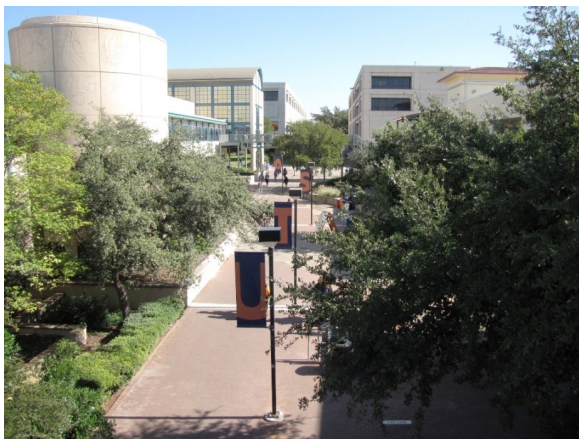
University of Texas in San Antonio