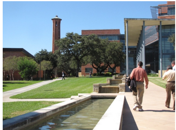
Trinity University, San Antonio Texas