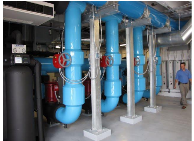
Valencia Community College Chillers Plant

Click here to download the presentations and to view more pictures.