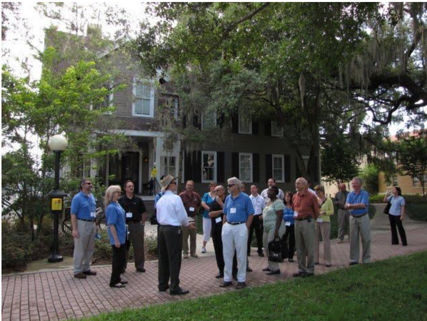
Rollins College, Campus Tour

Special thanks to the staff of Rollins College & Valencia Community Colleges you have every reason to be proud of your Campuses and it showed in the way you spoke about them. Your generosity made our conference a tremendous success.